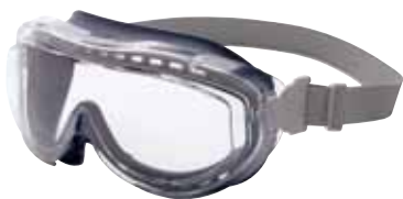
Clear — Ideal for most indoor work applications