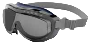
Gray — Minimizes outdoor sunlight and glare