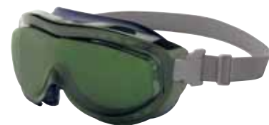
Shade 5.0 — Infra-dura® welding shade for cutting and gas welding operations