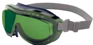
Shade 3.0 — Infra-dura® welding shade for torch soldering, brazing and cutting operations